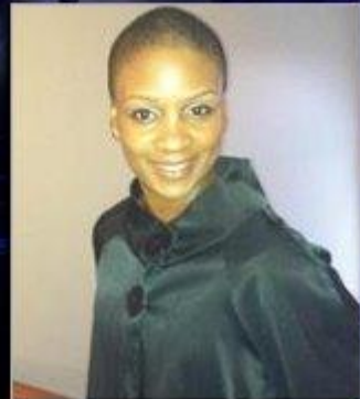
Minister N' Fannie New York, NY

9255 EAST ROOSEVELT BLVD PHILADELPHIA PA 19114 | INFO: 484.479.4935 • 877.371.9157